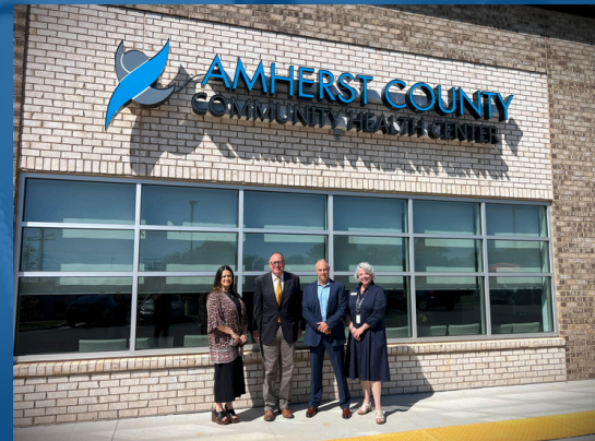
Johnson Health Center leadership meet with Senator Creigh Deeds

By serving as a persistent voice in Richmond and Washington, D.C., we ensured that the needs of our community remained at the forefront of the legislative agenda. We remain committed to breaking down barriers to care, ensuring that Johnson Health Center remains a reliable pillar of health for all.